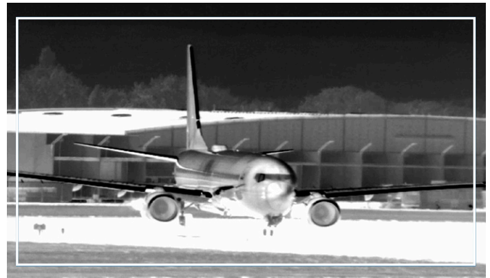
VINDEN 75 at ~1 km