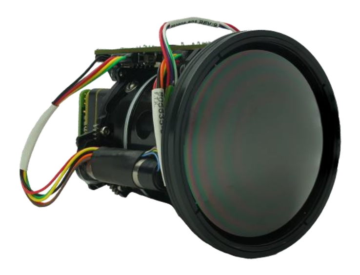
Figure 1: Official product Image of Vinden 75T