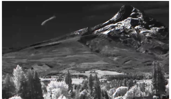
Mt. Hood, Oregon